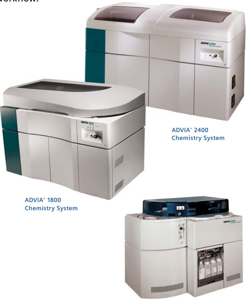
ADVIA® 1200 Chemistry System

VeriSmart™ Technology is the combination of hardware and software checks that work in harmony to ensure accuracy of test results without interrupting workflow.