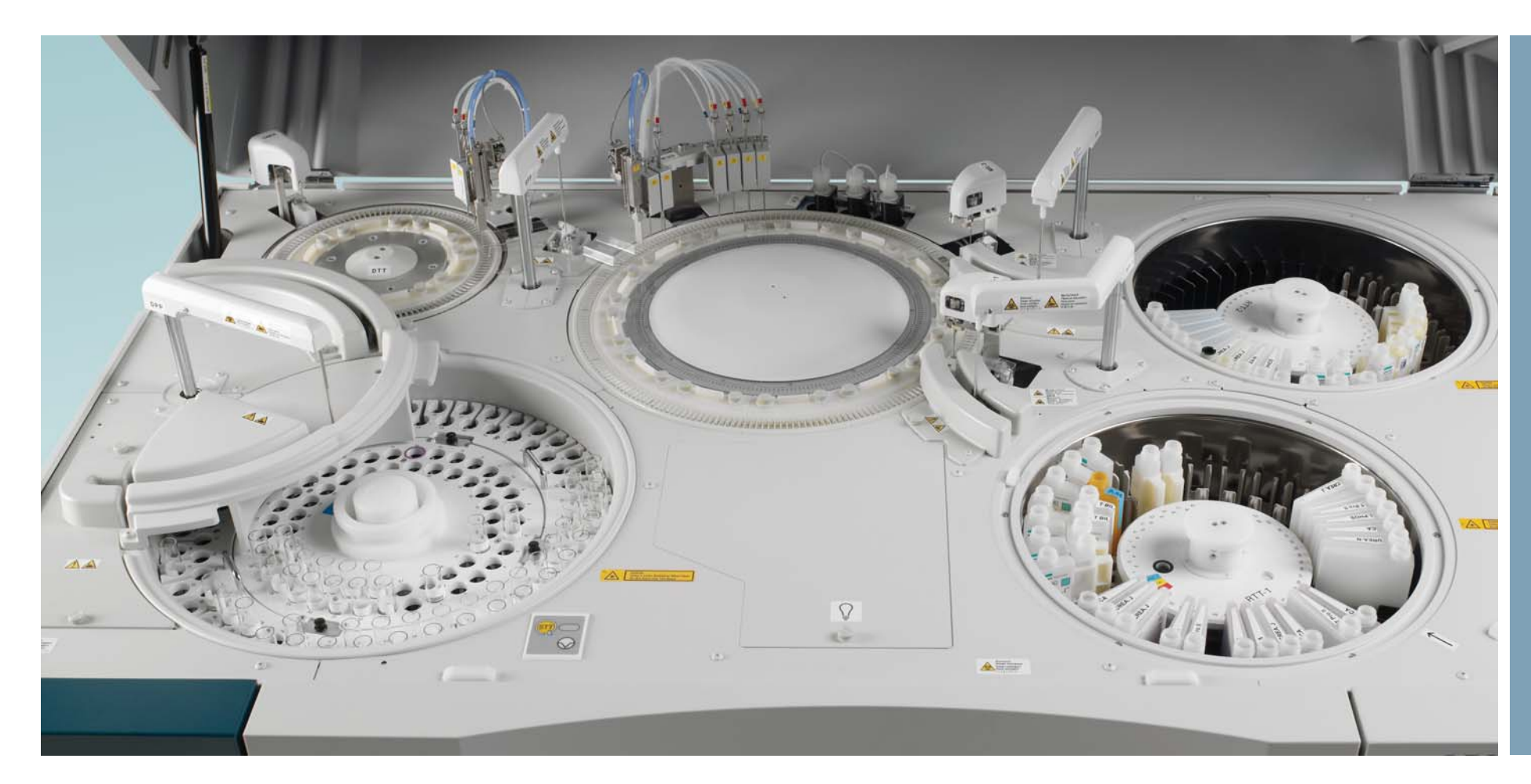
Point-in-space technology: primary probe can swing out 225° for sampling without requiring additional robotic interface

Introducing VeriSmart Technology, a processing verification system that brings new levels of accuracy to chemistry testing. By integrating hardware and software checks at every stage of sample processing, VeriSmart delivers results you can rely on test after test. And because it's coupled with all the advanced features of ADVIA Chemistry, you also get unmatched efficiency, reliability, and productivity. Make a VeriSmart choice for your lab—choose ADVIA Chemistry.